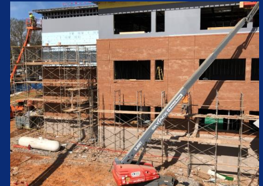
Eight day time lapse from framing to brick exterior