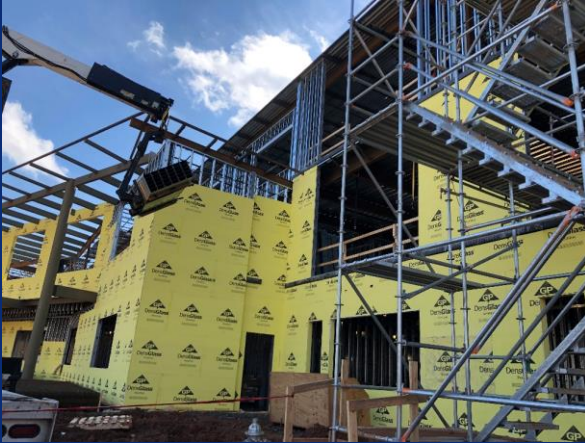
Sheathing on main and 2 nd west

Project Purpose Statement: To build a new elementary school for Atlanta Public Schools that will create a diverse and innovative learning environment, allowing students' minds to soar.