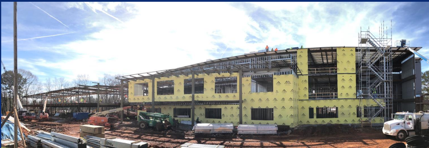
Photo of the project site from sidewalk on Westhaven looking south