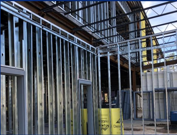
Interior framing on main and 2nd