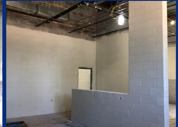
Kitchen, server and faculty dining areas receiving block fill