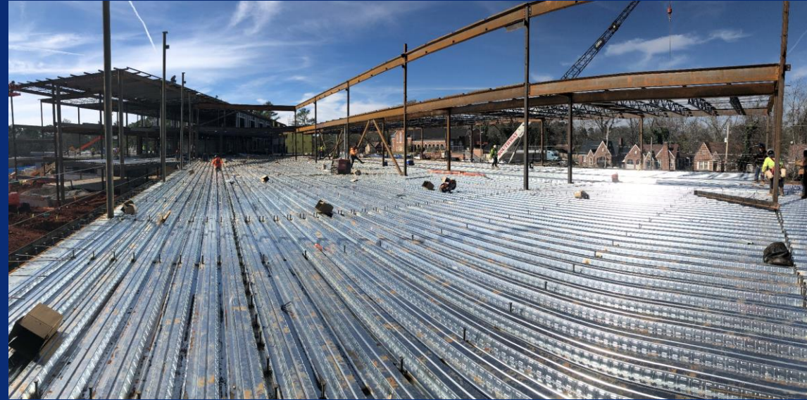
Decking for 2 nd level east installed