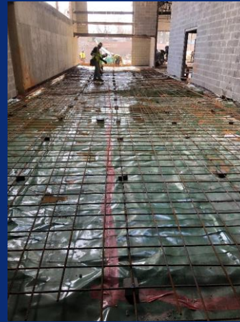
Reinforcing install ongoing ahead of concrete pour in polished area