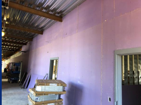
Interior priority walls receiving GWB